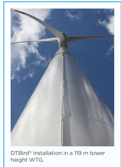
DTBird® installation in a 119 m tower height WTG.