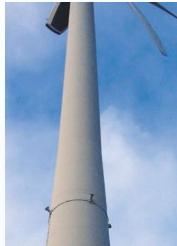
DTBird® Collision Avoidance Module Speakers installed on the WTG tower. 4 to 10 Speakers can be installed per WTG.